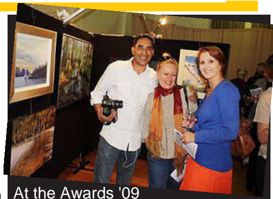
At the Awards '09

They are really up-to-date with things, encouraging artists wanting to exhibit to do so 'on-line'. Not only that, if you use snail-mail it will cost an extra $30 to enter. Definitely worth a stint so make note of the closeness of the closing date for entries.